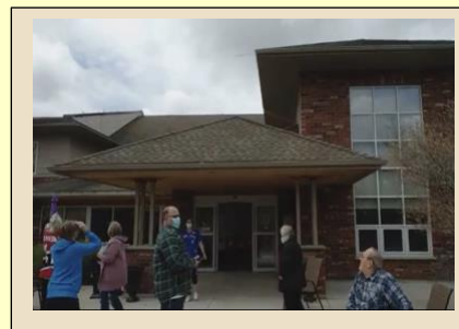
Right: PP Syd enjoying the fly over with Moira Place friends.