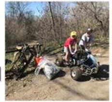
2018 Kiwanis Trash Bash

The Municipality of Tweed is excited to announce that the 2021 Trash Bash will be held Saturday, May 29th to Sunday May 30th! It will look different this year, with increased health and safety COVID-19 protocols to reflect public health requirements.