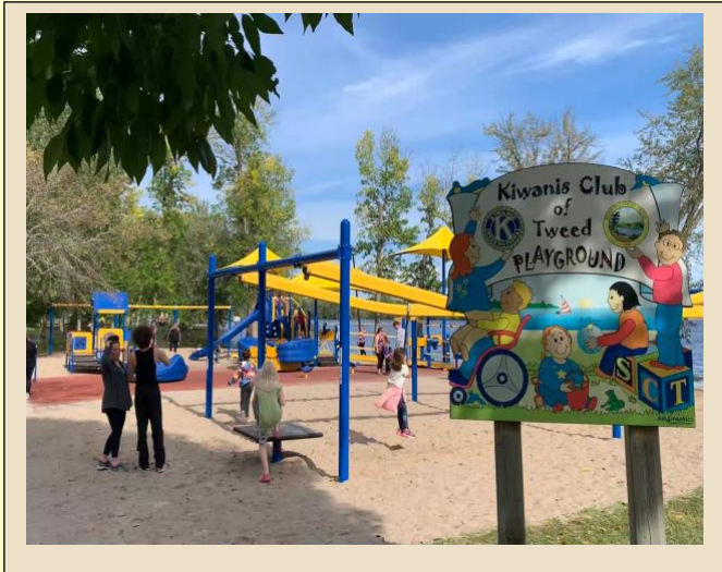
We are definitely proud of our new Kiwanis Accessible Playground and grateful to all those who helped make it happen!