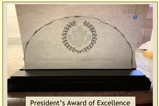
President's Award of Excellence