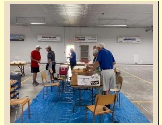
Fellow Kiwanians on the packaging line...what an awesome Team! Okay ...so this is the group I work with! Perhaps I am a little biased.