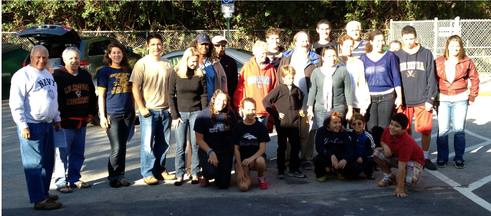
Here's the gang before making Turkey Deliveries on Thanksgiving morning. Great turnout! Thank you AHS Keyclub!