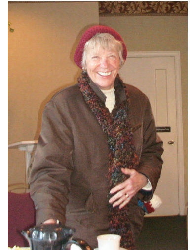
Alberta's not really that happy it's cold outside