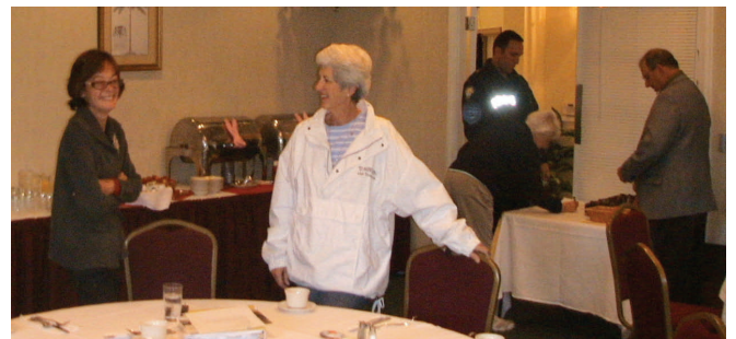
There's that light again.....Spooky.....