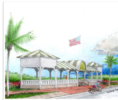
A replica of the original 1929 pavilion

raised over $35,000. They still have a long way to go to reach their goal of raising the $240,000 needed to build the Pavilion. The final cost will actually be lower since they have also received offers from local contractors and businesses to contribute landscaping, labor and other materials. For more information call the BPOA at 561-276-2632 or E-mail: