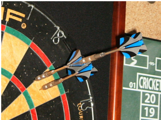
The shot of the Century!