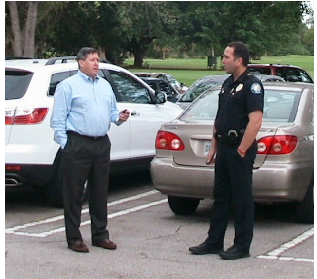
"I can't help it, officer. Someone has hypnotized me to park illegally!"