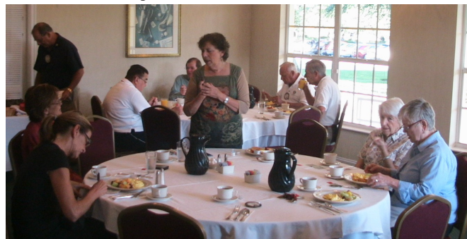
"OK Ladies.....No Men allowed at our table.....Right?"