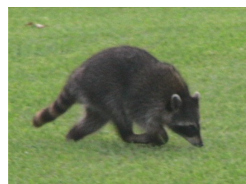
Spotted this guy during breakfast. Terrill wanted to sign him up!