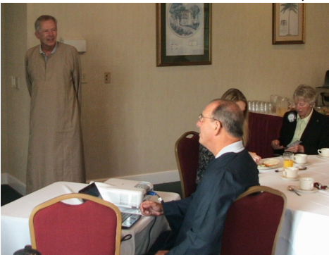
"And people think I have clothes on under this"