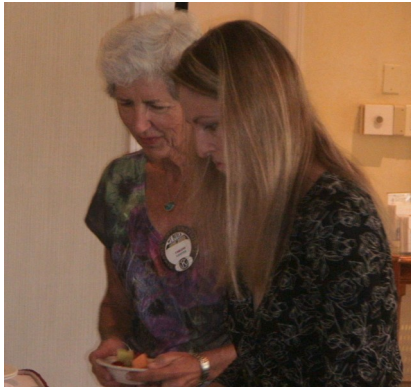
"Now, how do you do this?"