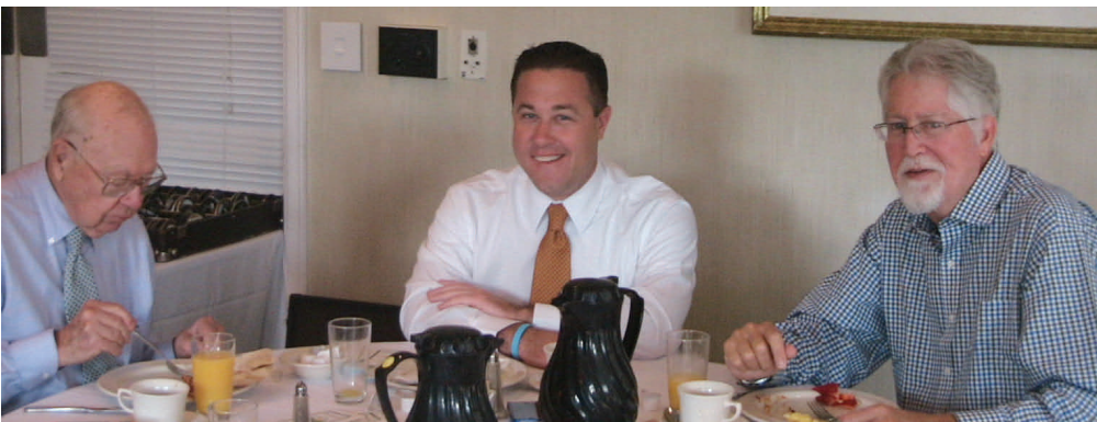
The Boys from the Noon-Time club. Great to see you guys!