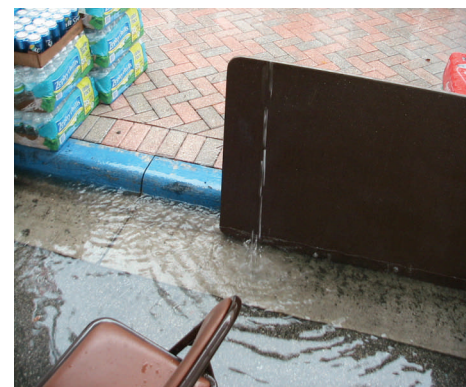
We got Flooded during the Friday Rain!