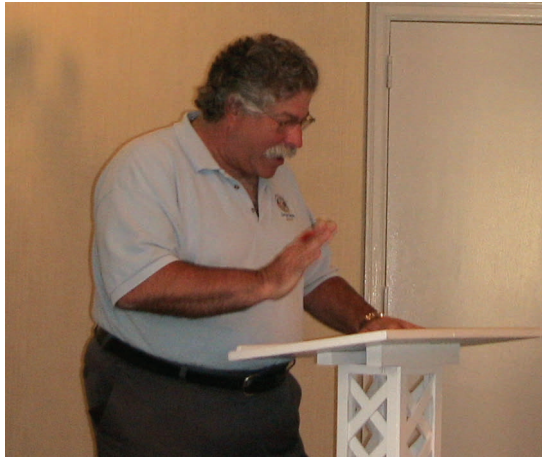
Notice Mr. "This Day in History" blushing? He just realized he was giving us the events of Sept. 5th on October 5th! Whoops.