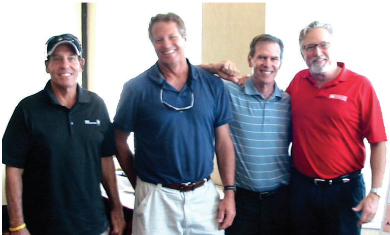
2nd Place team