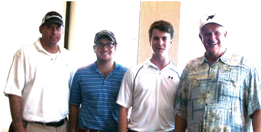
1st Place team (Anyone we know?)