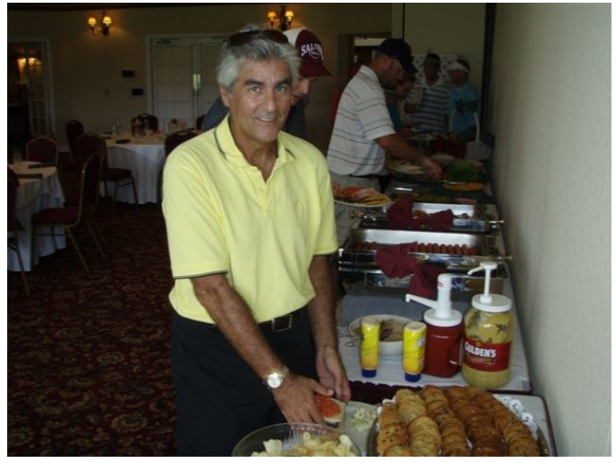
"Forget the other food....Give me COOKIES!"