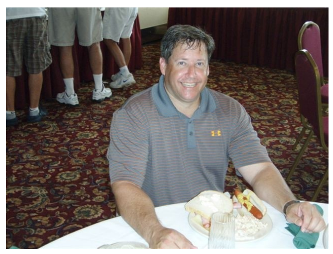
"Honest, this is only my third helping"