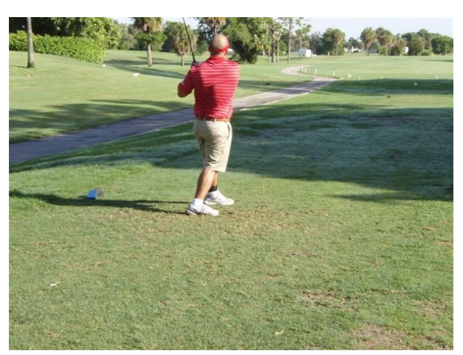
"Just like Tiger Woods......Right?"