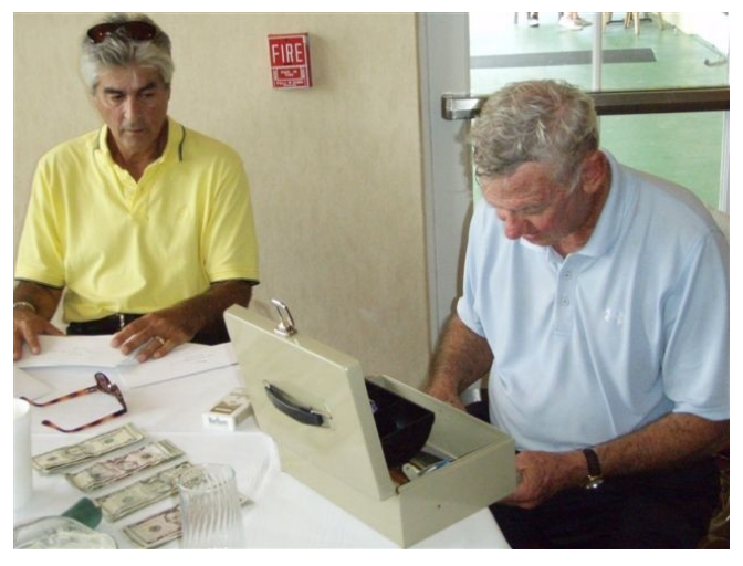
"Let's see, One....Two....Three....Ummm...One.."