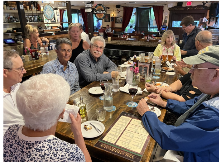
Happy Hour @ Finnegan's