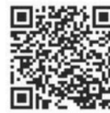
Bert Shoemaker Award