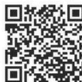
Nathan Hale Award