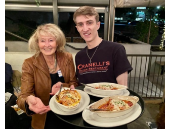
Dinner is served – Yummy Italian meals at Cranelli's Italian Restaurant, Lone Tree