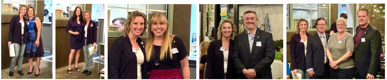
Installing Officers and Directors = Congratulations!