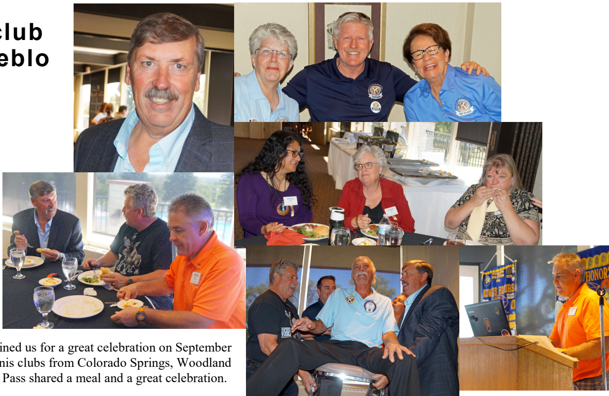
Three clubs joined us for a great celebration on September 22. The Kiwanis clubs from Colorado Springs, Woodland Park,, and Ute Pass shared a meal and a great celebration.