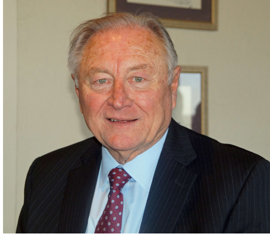
Pueblo Mayor Nick Gradisar