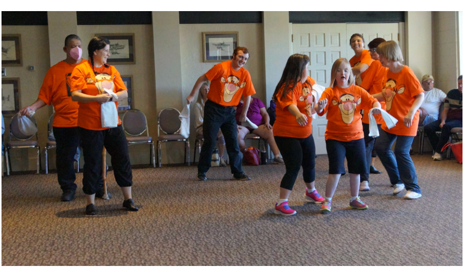
Dance Group from Sangre de Cristo Art Center Dance School