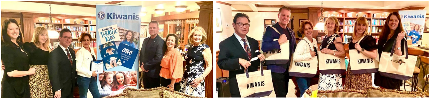
Thank you to Past Board of Directors for their service 2021-2022