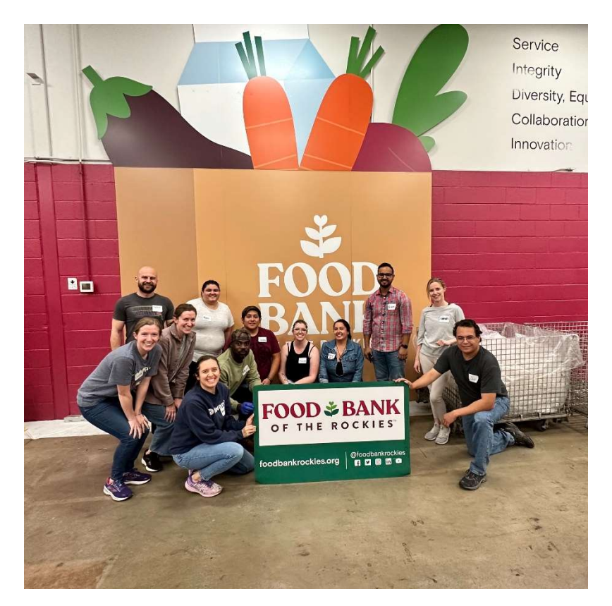
In May, we had a great turnout at Food Bank of the Rockies!

From May through July, we volunteered at Metro Caring Food Bank, the Food Bank of the Rockies, ¡Viva! Streets Denver, and Soles4Souls, totaling 152 services hours in these months. Since October 2022, we've done 597 service hours! This past weekend, we also hiked Mt. Bierstadt and raised money for the Griffith Centers.