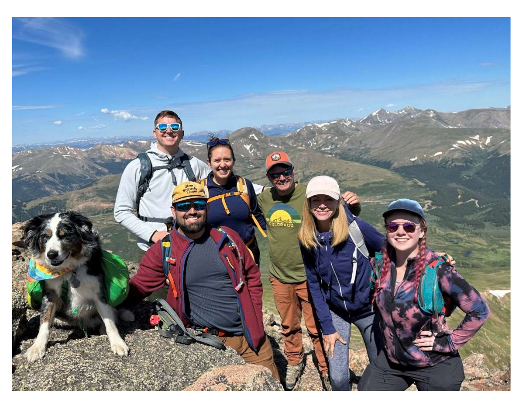
Denver Kiwanians (and their furry friend) at the top of Mt. Bierstadt