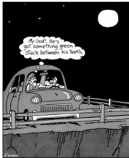
Popeye on the dating scene