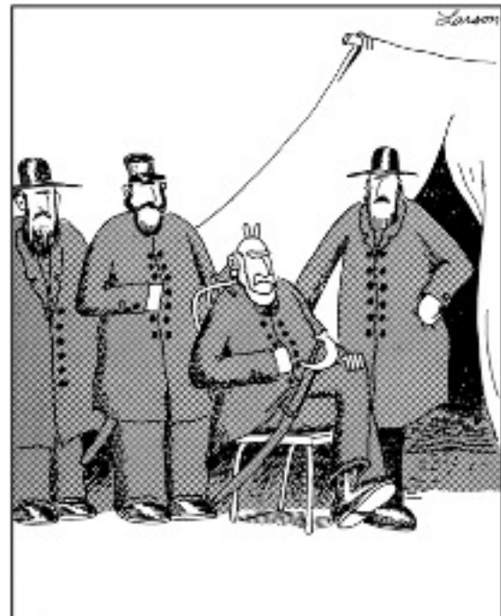
Near Gettysburg, 1863: A reflective moment

Calling bigotry an 'opinion' is like calling arsenic a 'flavor'.