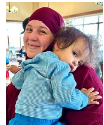
The woman and child in the last photo are from Algeria. It is their first Christmas.