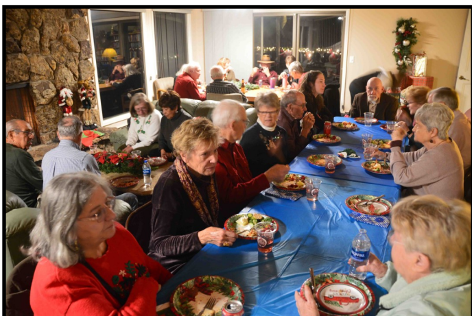
A huge crowd of Kiwanis members and spouses attended the Club Christmas party at the Adriel Hills Clubhouse on December 3.