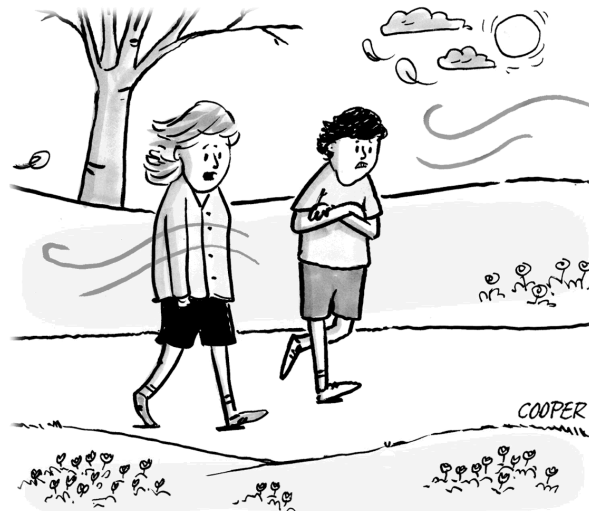
"March is great. You can binge all four seasons in one day." Cartoon by Nathan Cooper

The Center for Family Outreach is having a fund-raising breakfast on April 24 . PGK will be sponsoring a table. We'll have to figure out who's going to go.