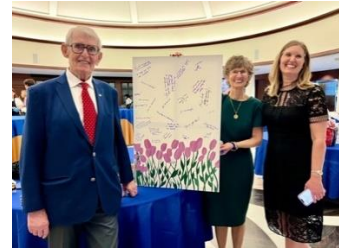
Jamison Family Team