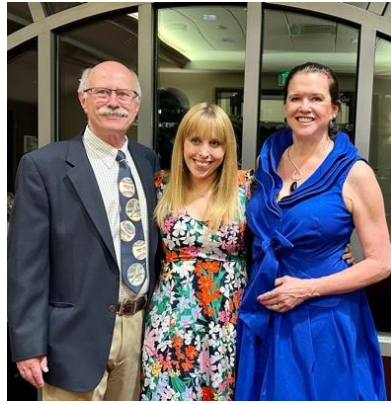
Coombs Family Team