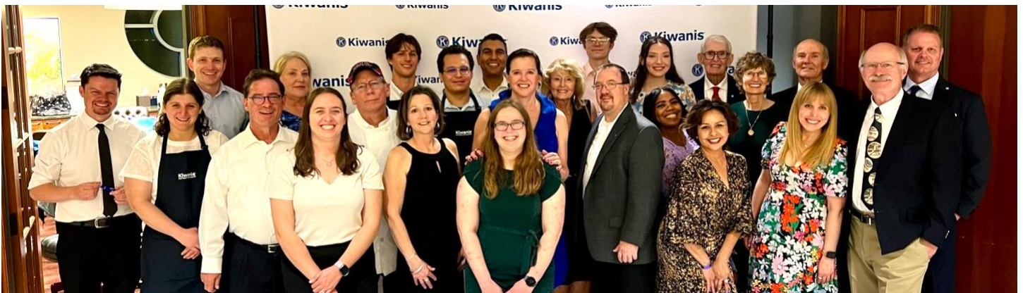
The Volunteers who made it all happen! Thank you! Apologies to those who left before the photo.

The new floor plan worked extremely well; the games were heavily used and the VIP room could enjoy the great piano player!