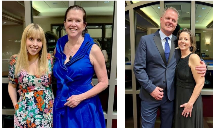
Great Leadership and Organization