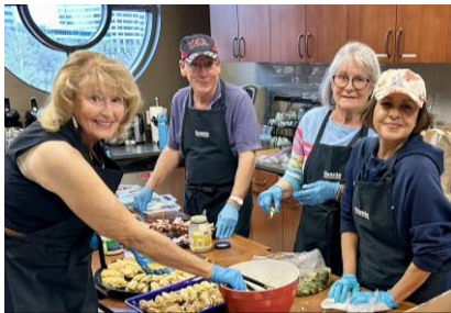
Hard at work in the kitchen – food prep