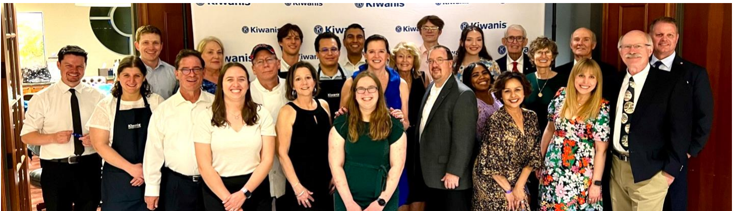
The Volunteers who made it all happen! Thank you! Apologies to those who left before the photo.

The new floor plan worked extremely well; the games were heavily used and the VIP room could enjoy the great piano player!