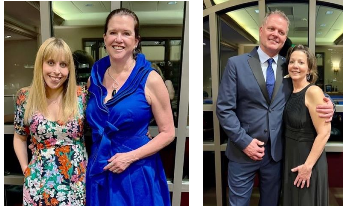
Great Leadership and Organization