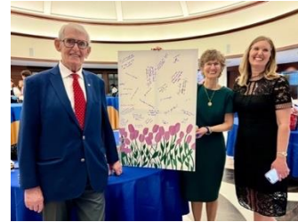
Jamison Family Team