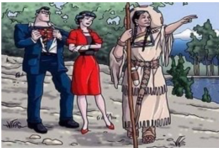
Sacagawea guides the Lois and Clark expedition