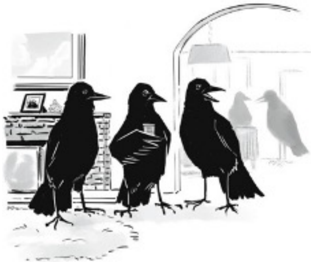
"This is barely a manslaughter."