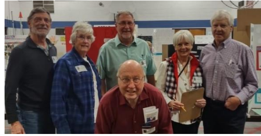
File photo Science Fair last year