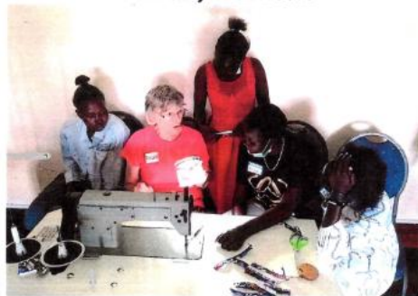
Teaching sewing to Seeds of South Sudan Students in Kenya

VALENTINES for SEEDS of SOUTH SUDAN ~A Party with Heart~