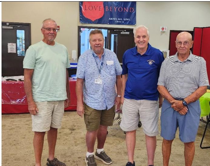
Fantastic Farm Progress Committee