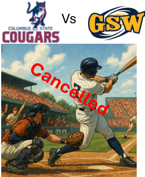
Baseball Social and Cookout April 24, 2026, at 6 PM