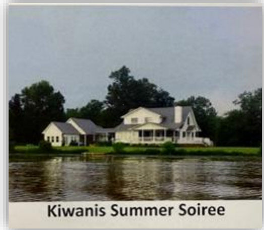
Saturday, May 30, 2026

Location will be at the Quality Inn on MLK.