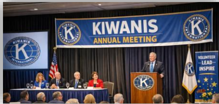
Americus Kiwanis Annual Meeting Friday, May 15, 2026, at 1 PM