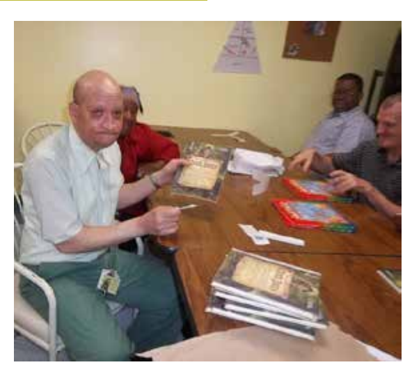
Labeling books for the Kiwanis District Project