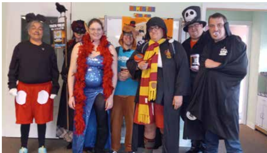
Tri-Cities Aktion Club went Trick Or Treating For UNICEF in downtown Grand Haven on Halloween. They raised $64!