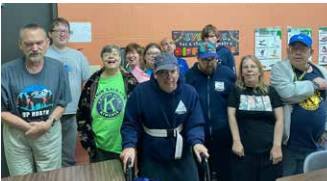
(Below) The members of the Grand Traverse Industries Aktion Club held a bake sale for their Annual Pumpkin Dance.