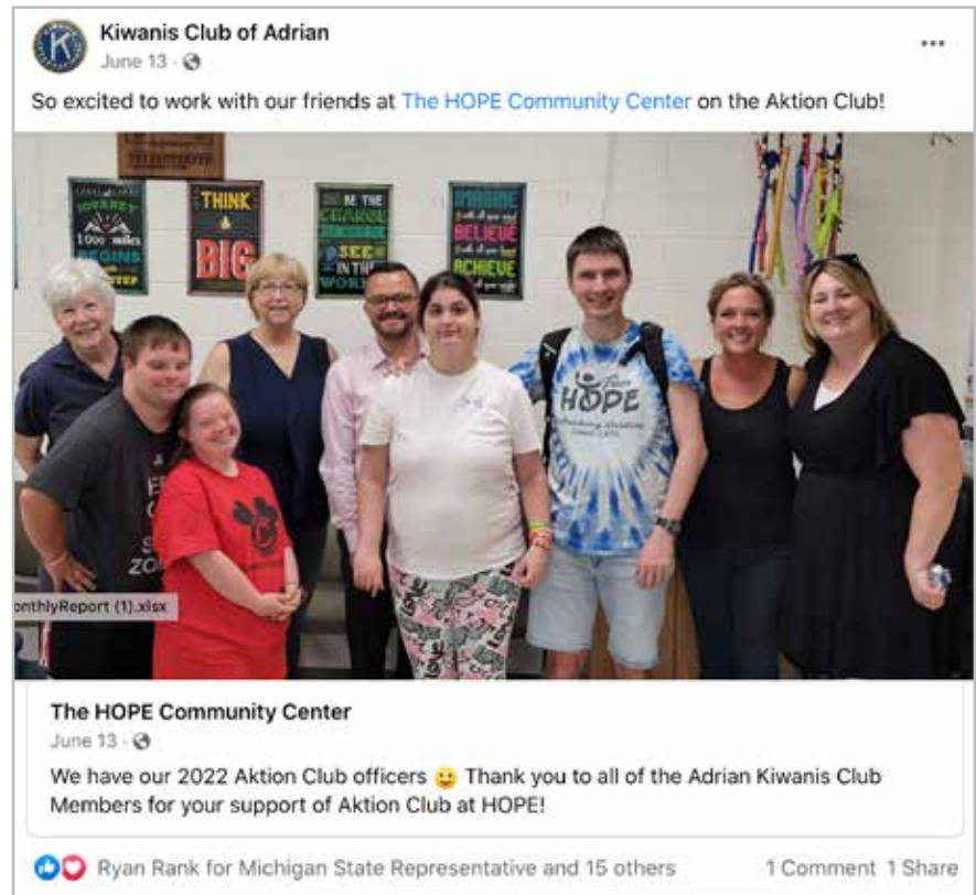
(Above) Facebook post showing the Lenawee Aktion Club officers and members.

Best wishes to the Grand Traverse Industries Aktion Club in Mancelona, newly chartered in October and already working on fun activities.