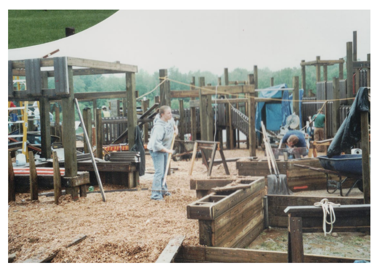
Hawk Island Playground (unknown)

The club's current signature project is a partnership with Reo Elementary School. The partnership has allowed members to provide a variety of services to the students, faculty, and the school property. Even though some students are learning remotely, members deliver 100 Weekend Survival Kits that include breakfast items, easy-to-prepare meals, protein-rich easy entrees, dairy (when available), and snacks, every other week. Club members have also tutored students, served breakfast prior to standardized testing, worked in the library, donated books and ear buds, mentored and read to stu-