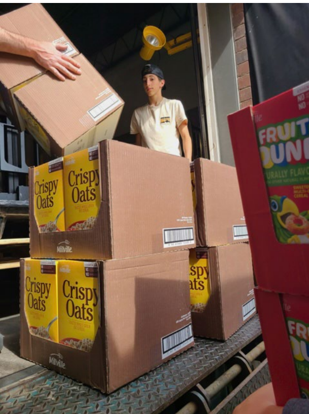
WHS Hockey Player Joe Crapanzano on the loading dock at Aldi's loading the buses