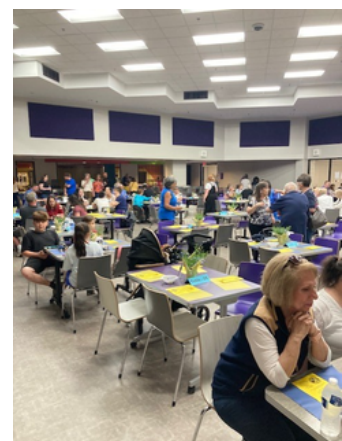
Our Shower Participants: