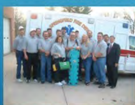
Pediatric Trauma Kit for Springfield EMS