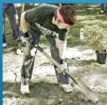
Grant to plant trees in Plattsmouth