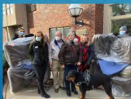
Grant to purchase rocking chairs for Ronald McDonald House