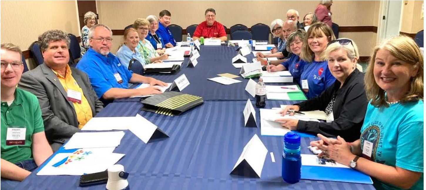
The Kentucky-Tennessee Kiwanis Board holding its annual convention meeting.

The August 2023 Kentucky-Tennessee District of Kiwanis Convention in Lexington, Kentucky was attended by 139 Kiwanians and 12 guests. Many excellent pictures were provided by some hard-working photographers (see their names in "From the Editor" above), but the limited computer space available for electronic on-line mailing made it impossible to use so many of them I would have preferred to use. What follows is a selection of some of those photographs.