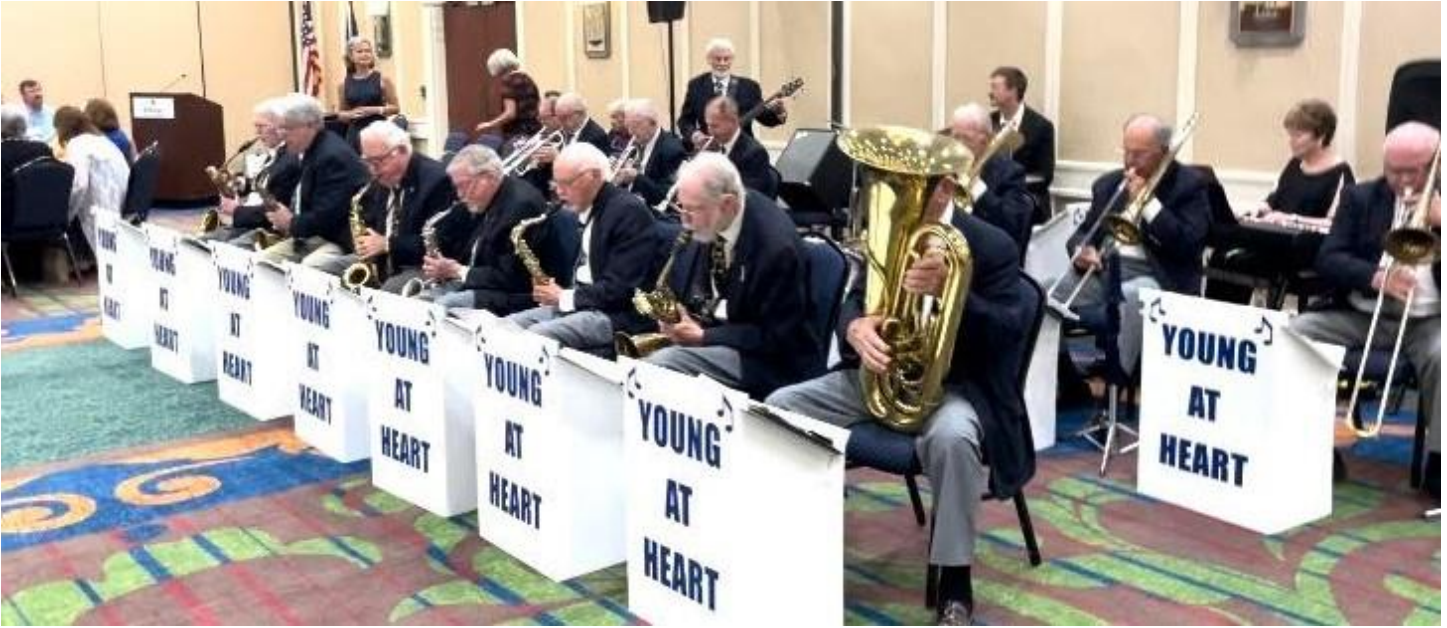
The Governor's Celebration was entertained with toe tapping Big Band music performed by this orchestra made up of mature folks, musicians whose average age was 80, who call themselves " The Young at Heart ."