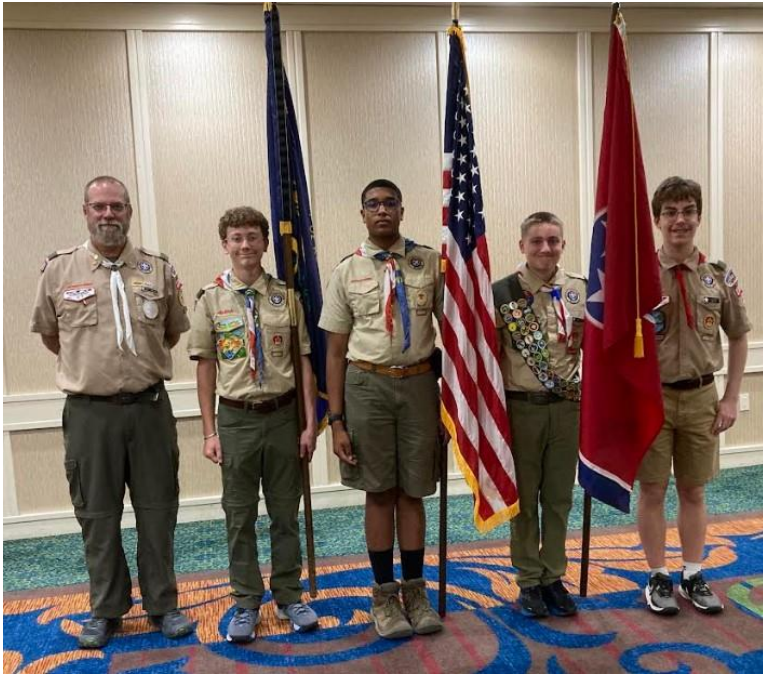
Scout Troop 110 and 112 posted the colors to begin the Friday evening opening session.