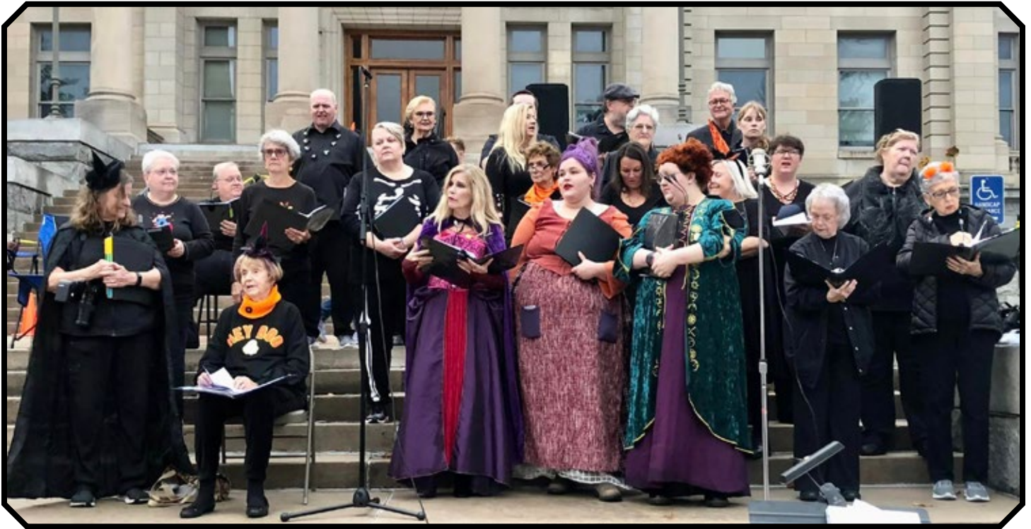
The City Choir was FA-BOO-LOUS

Rain, rain go away...and that it did for our 4th annual SPOOKTACULAR Trunk or Treat! Approximately a thousand wicked cute trunk or treaters had a fang-tastic time around Courthouse Square visiting over 30 vendors collecting candy, toys and free coupons. In addition, if you dare, you could pet and hold creepy crawlers Oh My!