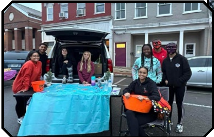
Paris Key Club