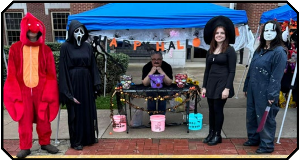
Bourbon County Key Club