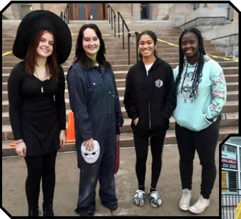
Paris and Bourbon Key Club Members who judged the pet contest