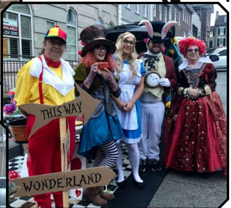
Paris KY Planning and Zoning took home 1st Place for costume contest.