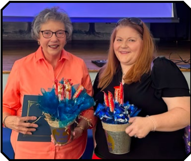
Spirit of Kiwanis