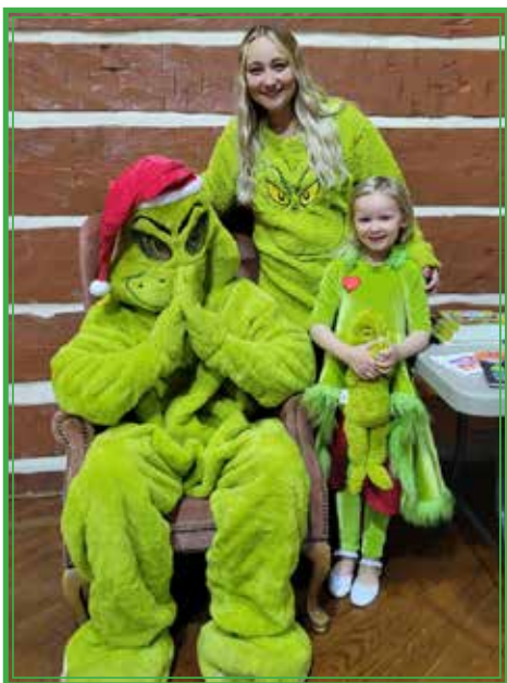
Grinch with guest who dressed like Grinch

The Kiwanis Club of Berea held its 15th annual breakfast with Santa and added the Grinch this year. He was a big hit with the kids of all ages. There was a great turn out for club member participation and they even had little help from some volunteers from Madison Southern High School come out to help. The event also had a very good response from the community Santa reported that he gave out over 200 canes, the clubs largest crowd to date. They raised over $600.00 for our projects that the club supports.