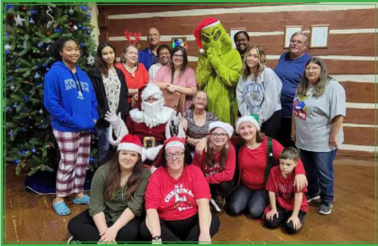
Santa & the Grinch with those in attendance

The Kiwanis Club of Berea held its 15th annual breakfast with Santa and added the Grinch this year. He was a big hit with the kids of all ages. There was a great turn out for club member participation and they even had little help from some volunteers from Madison Southern High School come out to help. The event also had a very good response from the community Santa reported that he gave out over 200 canes, the clubs largest crowd to date. They raised over $600.00 for our projects that the club supports.