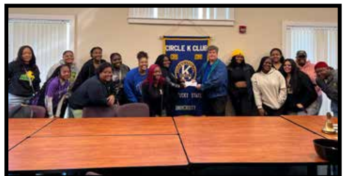
CKI Advisor presenting donations to the CKI club.