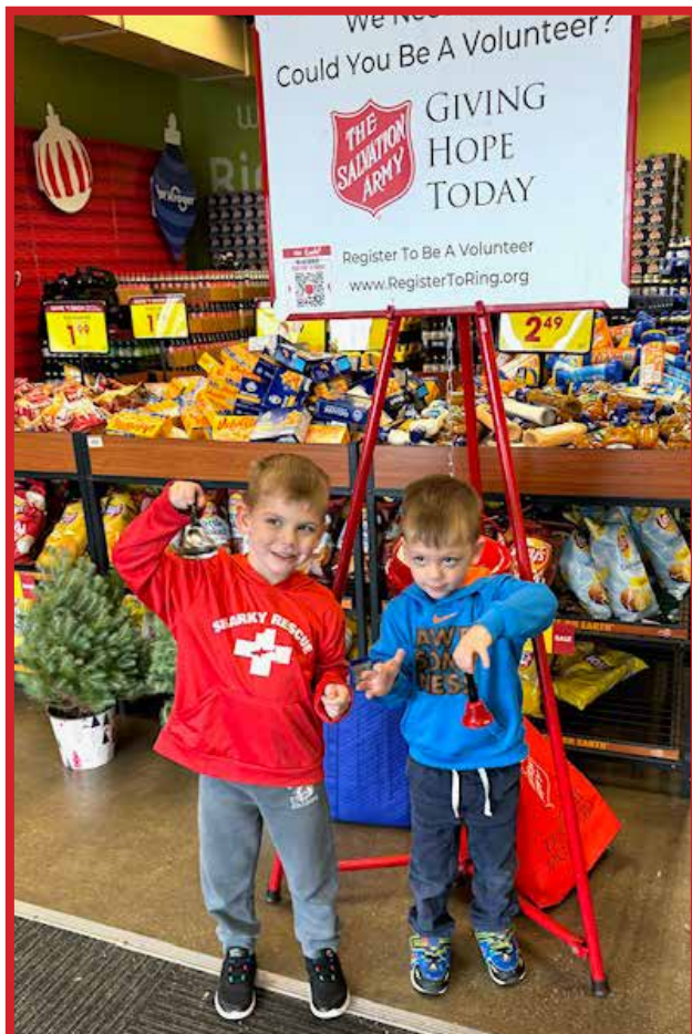
The Richmond Kiwanis club tries to give kids an opportunity to ring the bells.

Members of the Kiwanis Club of Richmond were bell ringers for the Salvation Army on December 2 at the Richmond Kroger Store.