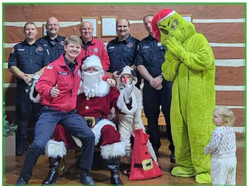
Berea Fire Department with Santa and the Grinch