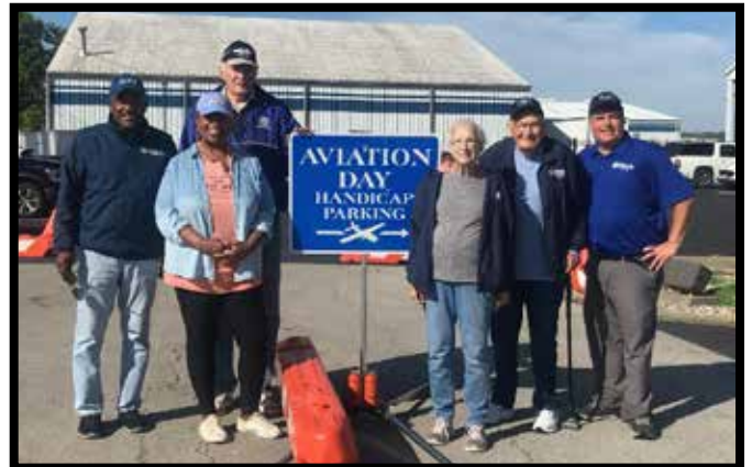
Members of the club helped with the Aviation day in Frankfort. First time being held since COVID.