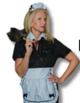
YVETTE THE MAID