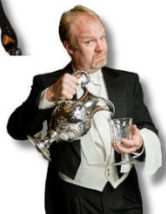
WADSWORTH THE BUTLER