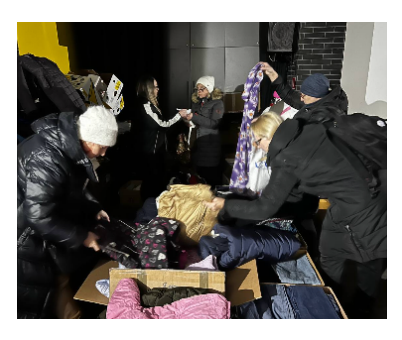
Serving the Children of the World at its Best!

After consultation with the President of Kiwanis International, the President-Elect, and the Governor of Romania, the Kiwanis Children's Fund in Europe launched a campaign to help the refugees from Ukraine. In response, the District of Austria provided support to the Ukrainian people by transporting food, clothing, medical supplies, etc. valued at more than $350,000. to the Ukraine border.