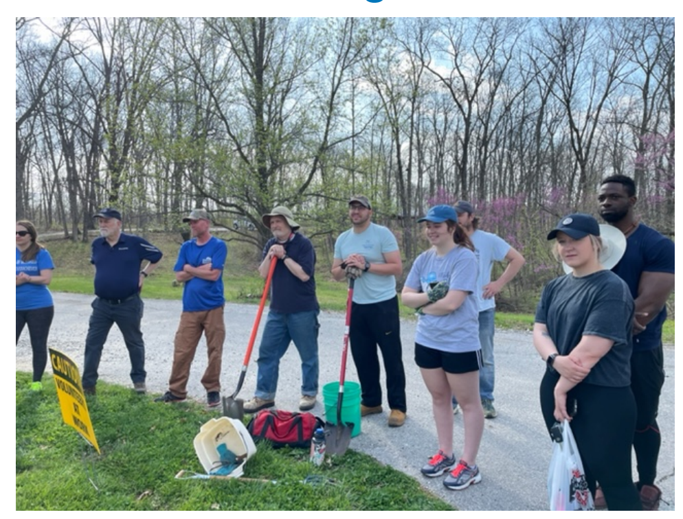
The project drew volunteers from three Kiwanis Clubs, K-Kids, neighbors and city staff. The clubs and volunteers have worked for two years to remove invasive honeysuckle that was choking the park. While there are still areas of honeysuckle to cut, much of the park will soon be blooming with wildflowers and native plants.