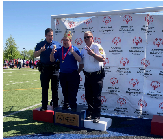
Olympic Medal Winner