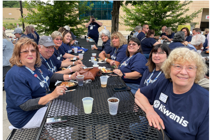
Some of the MO-ARK District Attendees BBQ Dinner at Victory Field before the Ball Game