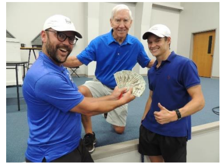
Last year's 50-50 winner

Saturday September 10 th at Magellan Golf Course with a 9:30 Shotgun Start.