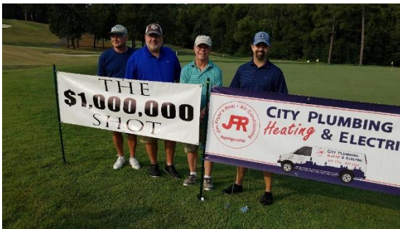
Team selected in 2021 for one member to take the Million Dollar Shot.

It's the 31 st golf tournament for Kiwanis Club of Hot Springs Village. Brookshire's has joined us for a second year as "Tournament Name" sponsor.