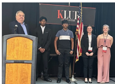
2024-25 Lt Governors