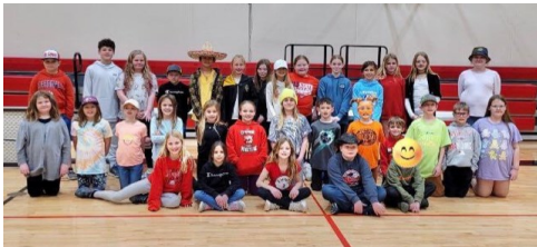
Pictured are Beaufort Elementary K-Kids.

An annual Beaufort Elementary School clothing swap was sponsored by the K-Kids at the school on March 7. Many families donated and many took advantage of this event to grab some things they could use. It is a great opportunity to clean out closets and share clothes that are not used any more. The kids love shopping and finding clothes that make them smile! The Union Kiwanis Club sponsors the Beaufort Elementary K-Kids. Union Kiwanis members helped pack leftover clothing and delivered it to Gerald Outreach.