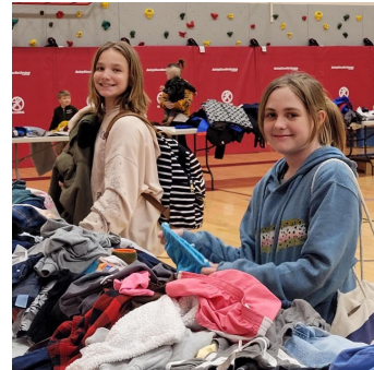
Two Beaufort Elementary School girls enjoying shopping at the clothes swap