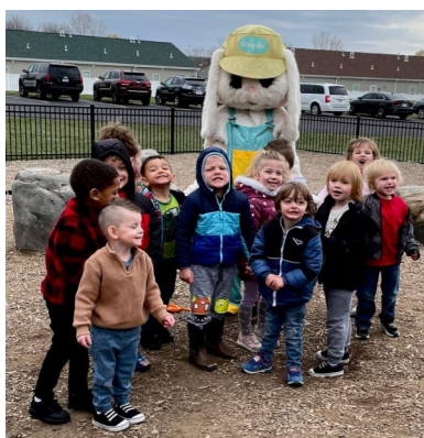
An Early Childhood class at Prairie Dell Elementary School in Union with the Easter Bunny