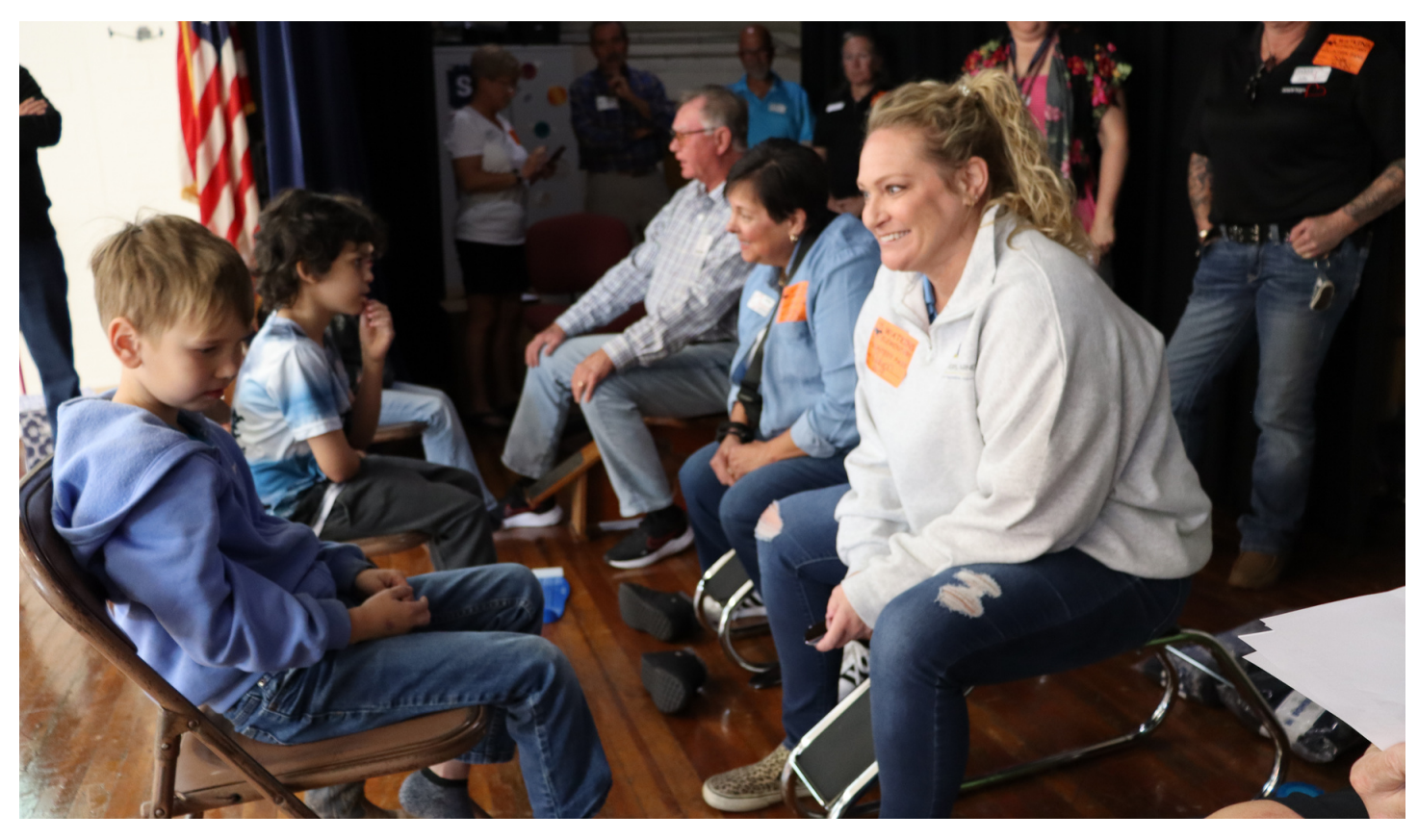
MORE THAN A DOZEN OZARK EMPIRE KIWANIS CLUB MEMBERS AND VOLUNTEERS WERE IN ATTENDANCE TO HELP DISTRIBUTE SHOES FOR STUDENTS IN A NORTH SPRINGFIELD ELEMENTARY SCHOOL.